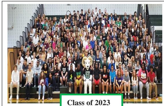
Class of 2023

9/27- Relay for Life @ Winter Place Park